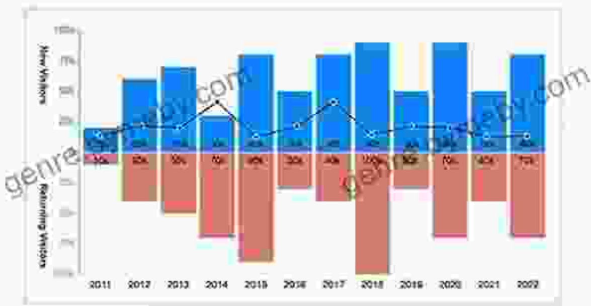
How to Visualize Data Using New and Returning Visitors Growth Chart?