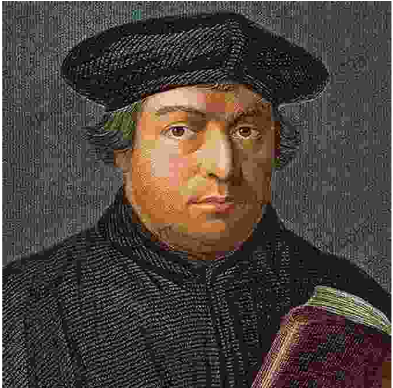
Yesterday Classics: A Time Capsule of the Past

and John Calvin, the Reformation challenged the authority of the Catholic Church and sparked a profound spiritual awakening. New Protestant denominations emerged, and religious wars ravaged the continent, forever altering the political and social fabric of Europe.